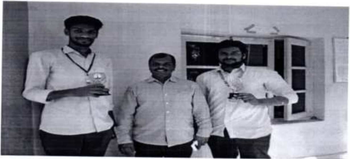
A PHOTOGRAPH -STUDENTS ALONG WITH ACADEMIC OFFICER

(Affiliated to JNTUH & Approved by AICTE, New Delhi) Ponnekal (Village), Khammam (Rural), Khammam (Dist) -507170 Phone: 08742 - 285399, 9908567792